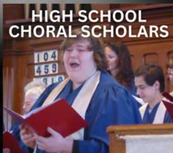
HIGH SCHOOL CHORAL SCHOLARS